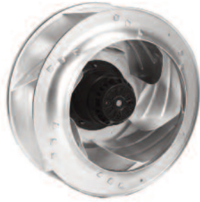
Duct Ring: DR400A (optional)