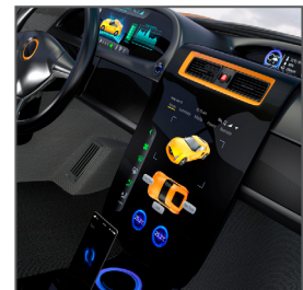
Automotive: Inside Devices