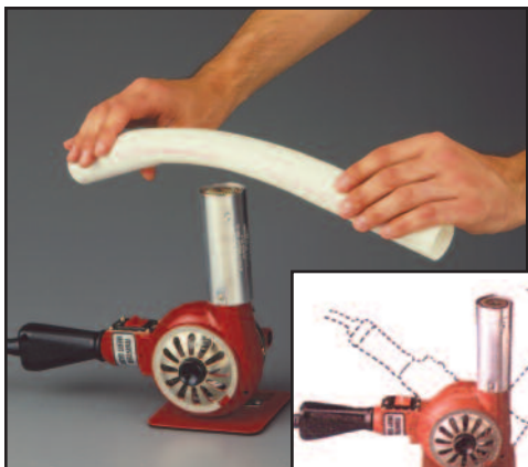
Stable base for hands free use.