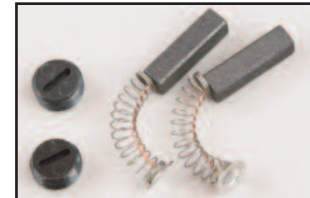
Brush, Spring and Cap Kit Part Number 35257

All 120V Models have standard 15 Amp plugs