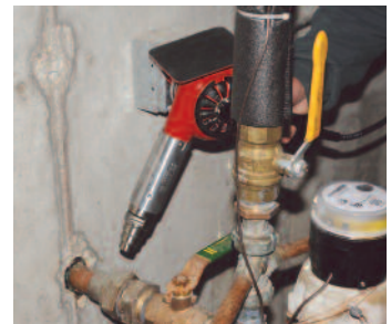
Heat pipes and more