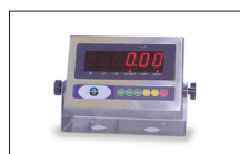
RD-1000 Resistive Load Cell Display