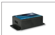
DI-100/DI-1000U Digital Load Cell Interface