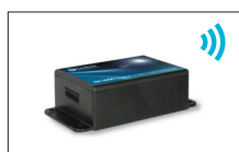
DI-1000ZP Wireless Load Cell Interface