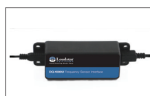
AI-1000 Signal Conditioner