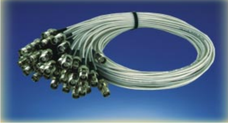
A small sampling of our capabilities are shown here.

ANTENEX® Precision Cable Assemblies™ will save you both time and money. Let us do the work. We are highly equipped to put together just about any combination you may require in a very fast turn around time. We ship most orders the same day!