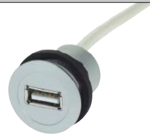
har-port USB coupler