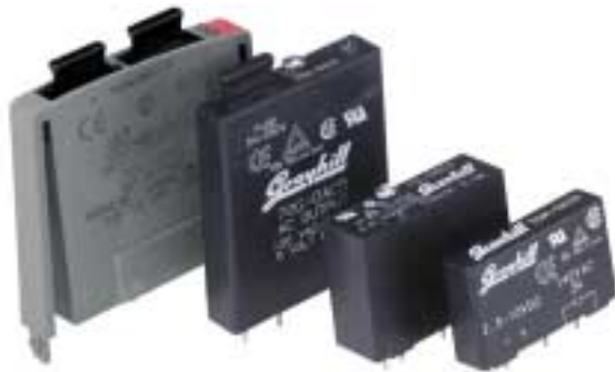
70L-OAC 70G-OAC 70-OAC 70M-OAC