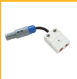
Universal Thermocouple Adapter