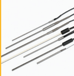
Calibrated Temperature Sensors

A wide array of accessories is available to help you maximize productivity, but the following are essential for most users.