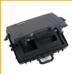
Probe and Readout Case