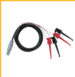
Universal RTD Adapter