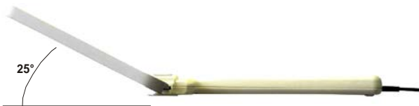
Side view of ID ISC.ANTH200/200-A

The maximum read range will be realized in the middle of the antenna. The optimum orientation of the tag is parallel to the antenna.