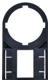
Holder, Length: 27 mm, Width: 18 mm, Colour: Black