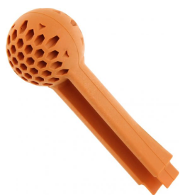
Actuating tool, Material: Polyamide