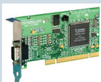
UC-320 LP uPCI 1xRS422/485 1MBaud