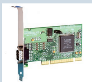
UC-324: uPCI 1xRS422/485 1MBaud