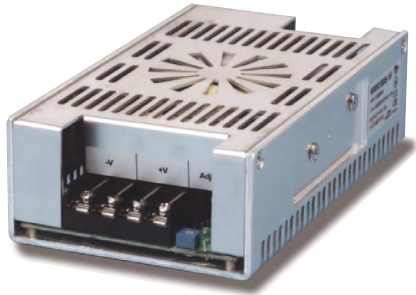
3"W x 5"L x 1.7"H