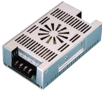
3.5"W x 6"L x 1.75"H