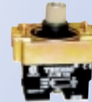
LED Pilot Light