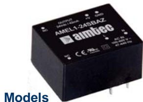
Models Single output