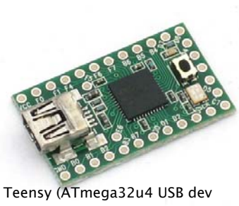
Teensy (ATmega32u4 USB dev (/products/199)