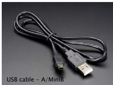
USB cable – A/MiniB (/products/260)