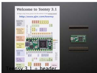
Teensy 3.1 + header (/products/1625)