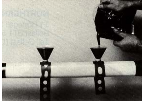
Easy to use system.