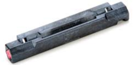
3M™ Fibrlok™ 250 µm Fiber Splice

3M™ Fibrlok™ 250µm Fiber Splice helps enable fast, easy splicing of 250µm singlemode fiber in Fiber-to-the-Premises (FTTP) installations. It can also be used in multimode LAN installations where 250µm coated fiber is spliced. This low-loss reliable splice can be installed by non-specialized technicians.