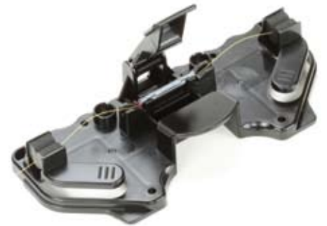
3M™ Fibrlok™ Splicing Tool